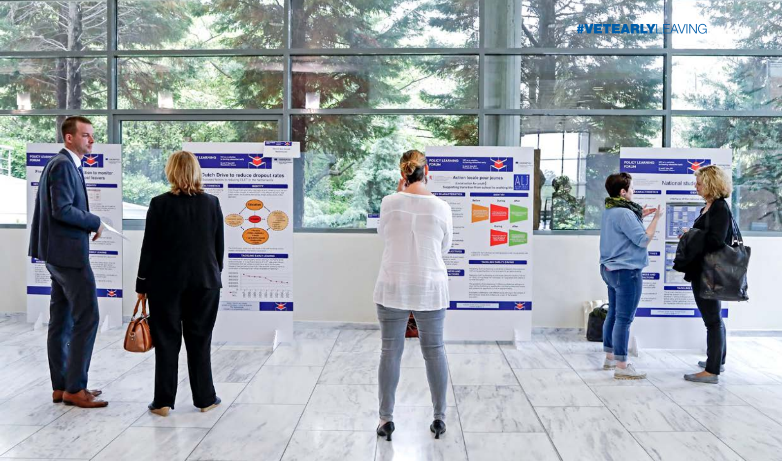
Poster exhibition – Cedefop’s policy learning forum on VET as a solution to early leaving

and mental health services, law enforcement, and labour market aspects (including input from employers) are often used to assist efforts from parents/guardians and educators. PACA (VET portal) in Portugal is a digital platform that records key information – such as attendance, absence, competences and evaluation – in an online learner profile accessible to outside interests who can help improve prospects for the individual, as well as teachers and parents or guardians.