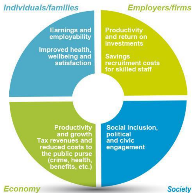
Cedefop (2017) Investing in skills pays off: the economic and social cost of low-skilled adults in the EU

Similarly, a recent report by Cedefop goes beyond economic outputs and makes the case for proactive measures to upskill low skilled adults to enable them to live fulfilling lives and contributes constructively to society as well as to the economy. The report in particular reviews the evidence that skills positively impact on crime and safety and health.